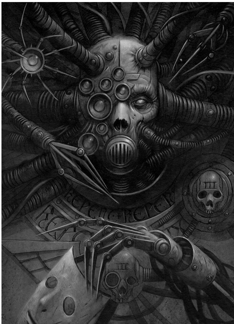
Kelbor-Hal, Fabricator General of the Mechanicum

Monolithic buildings flanked the roadways – factories, machine