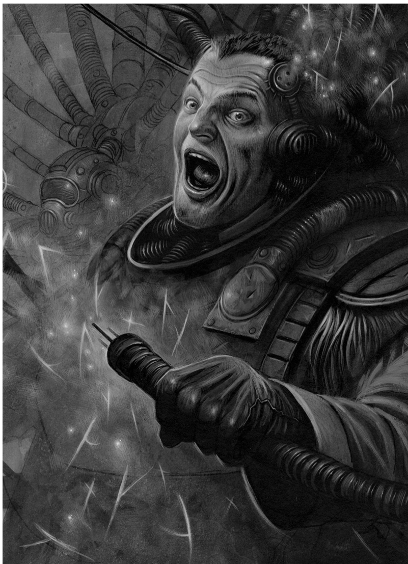
Princeps Sharaq encounters the insidious scrapcode

Sharaq gasped, his mind awlirl as his implants defended his neural