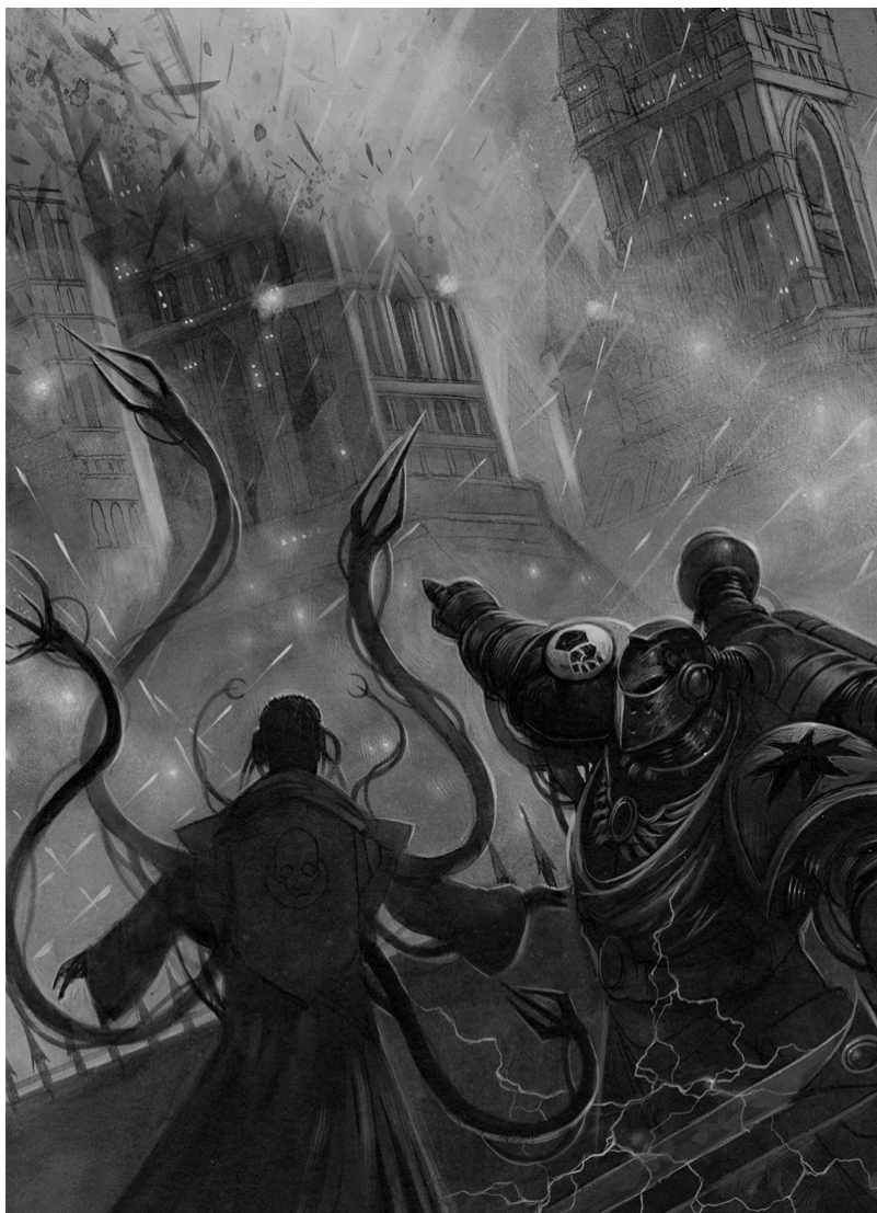
Sigismund and Kane witness the attack on Mondus Occulum

A thunderous, booming horn-blast echoed across the landing fields,