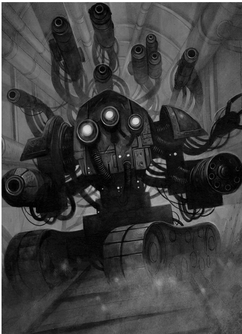
The Kaban Machine halts the mag-lev train

Even through the poor quality of the picter's image, Dalia could